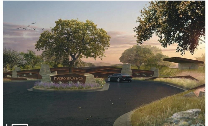
PROJECT NAME: MADRONE CANYON DATE: 07/01/2020 DRAWING: CONCEPTUAL DESIGN PACKAGE PAVILION PARK AREA PERSPECTIVE

One of the largest remaining lots available in Madrone Canyon. Madrone Canyon is on track to be one of the preeminent luxury communities in the Bee Cave area. Please check the attachment for artistic renditions of the gated entrance, pavilion area and landscaping throughout the community. This lot is located in back of the neighborhood with very little traffic. The lot is relatively level with many mature trees. This property feeds into the awarding winning Lake Travis ISD. The dedicated builder for this lot is Eppright Homes. Please check attachments for additional information. To access disclosures and other details about this property, go to: https://wkf.ms/3ERyvTh