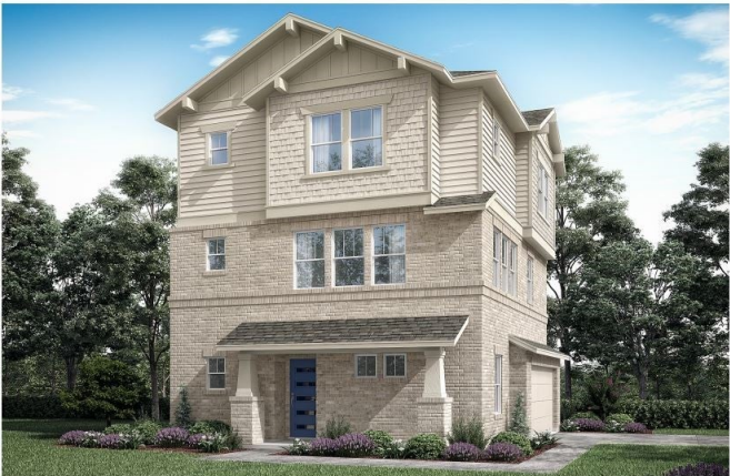
PLAN 1818 - ZILKER