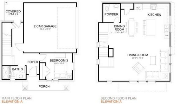
MAIN FLOOR PLAN ELEVATION A